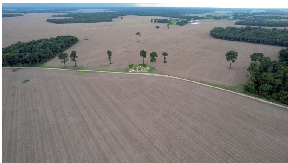
Figure 2 | Cemetery in the middle of the soybean fields in Belterra, illustrating the extinction of rural communities

Source: Image by Vincent Bonnal, November, 2021