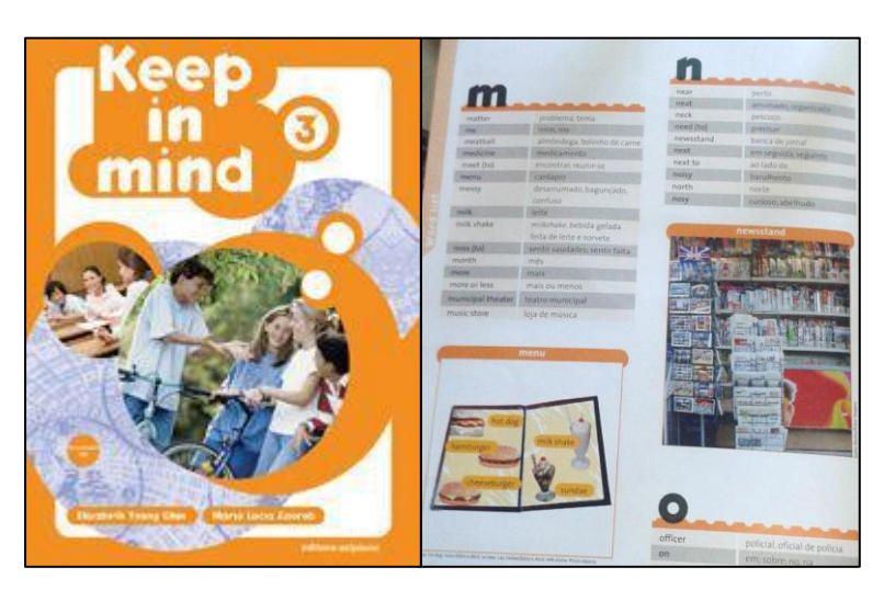
Figure 2: Cover page of the book and one of the wordlist pages in the book Keep in Mind.

There is also a part in the book which displays the theoretical background to support the teachers' ideas about EFL teaching methodologies. We believe that this initiative is a great one when it comes to helping the teacher to be updated about what has been taking place in the EFL teaching field. In the section named "AssessoriaPedagógica" (pedagogic assitance), the teacher may find help for using extra materials in the given subjects (s)he is teaching, such as movies, documentaries and websites. This initiative goes well with the principle (Blachowicz, 2001) about using multiple resources for English teaching.