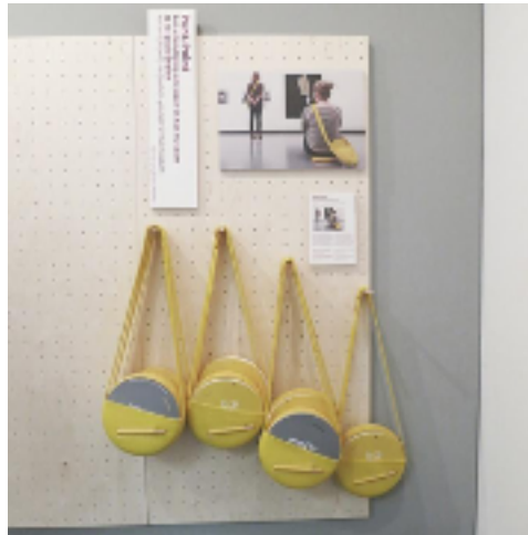
Image 4 - Punt.Point at the Van Abbemuseum (2013), Installation view.