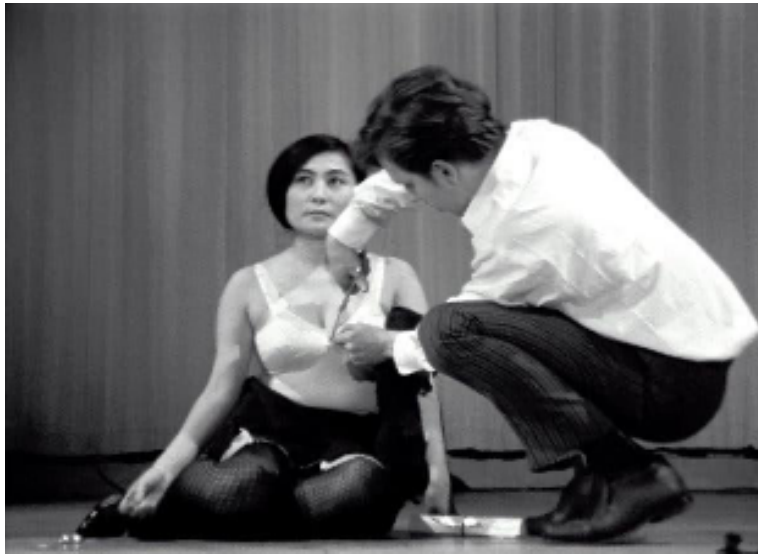
Image 5 - Yoko Ono performing Cut Piece , 1964.

Source: Retrieved from: https://static01.nyt.com/images/2019/10/31/books/30bookprincenthal3/30bookprincenthal3-articleLarge.jpg?quality=75&auto=webp&disable=upscale .