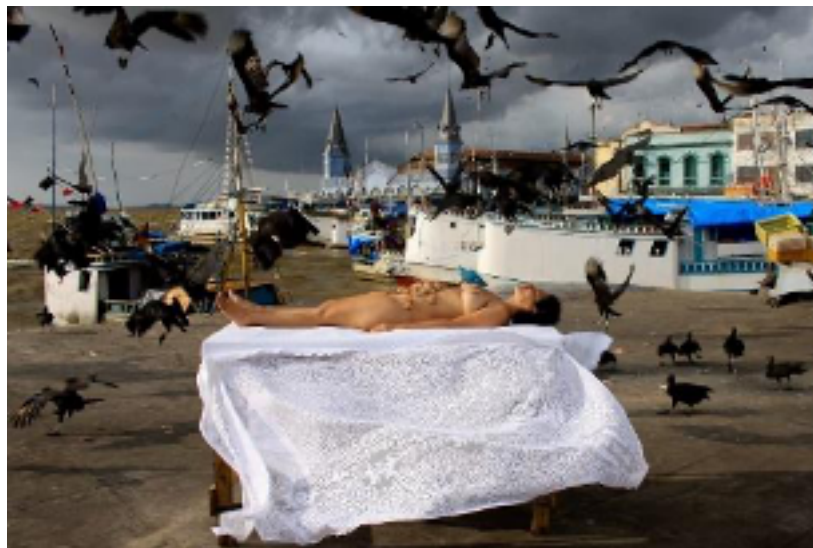
Image 3 - Berna Reale, Quando todos calam (When everybody silences), 2009.