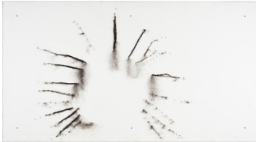
Image 1 - Remains of the performance Descarrego archived in MAR's collection.