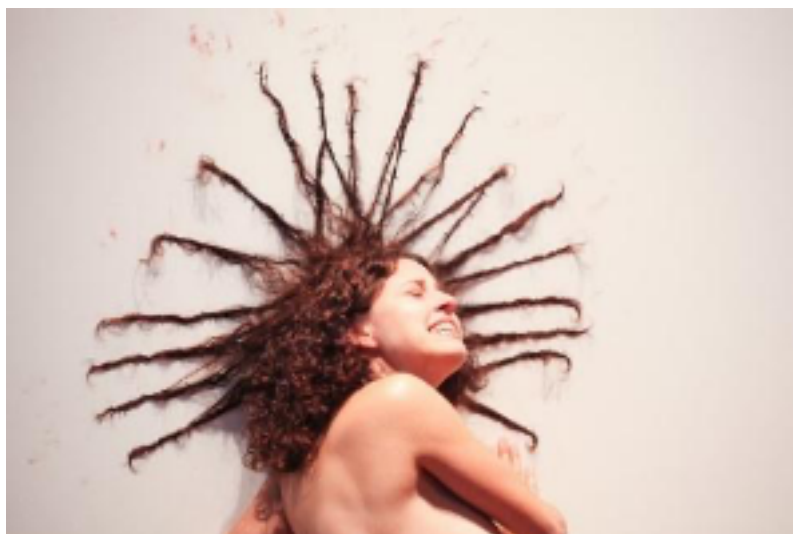
Image 2 - EmpreZa performing Descarrego in 2014 at MAR.

Source: Retrieved from: https://www.pipaprizo.com/wp-content/uploads/2013/06/1-1.jpg