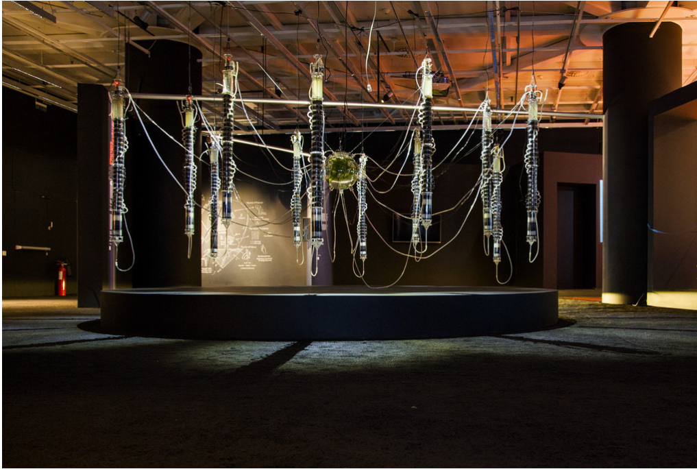
Figure 4 - Plantas Autofotosintéticas view of the installation; photo credit: Andreas Simopoulos, courtesy of Onassis Cultural Centre-Athens

The interviews and conversations with the individuals involved in the process flow into the exhibition setting in the form of video documentation. Moreover, the artist offers a sonification of the metabolic processes occurring in the exhibition space. He formulated his interest in developing the work further in these terms: