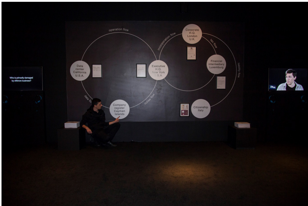
Figure 1 - Loophole for All , photo showing Paolo Cirio explaining the work; photo credit: Andreas Simopoulos, courtesy of Onassis Cultural Centre-Athens

Paolo Cirio's Loophole for All (Figure 1) is an installation that takes a close-up look at offshore financial centers like the Cayman Islands. The Italian artist, hacker and activist holds the opinion that "everyone should have the possibility of exploiting the same tax benefits that major corporations are constantly taking advantage of." 8 Accordingly, he offers certificates that exhibition visitors can simply hijack, documents that permit the holder to profit from those same tax advantages. In a city like Athens, from which many firms have relocated to Cyprus to escape high tax rates, this work seems to be especially relevant, but two stacks of certificates are not the only elements that make up the appeal of the exhibition setting. Above all, the artist succeeds in using space-filling infographics to call attention to and to elucidate the mechanisms behind the loopholes—what you need to get registered on the Cayman Islands and who has been enjoying life in this tax haven.