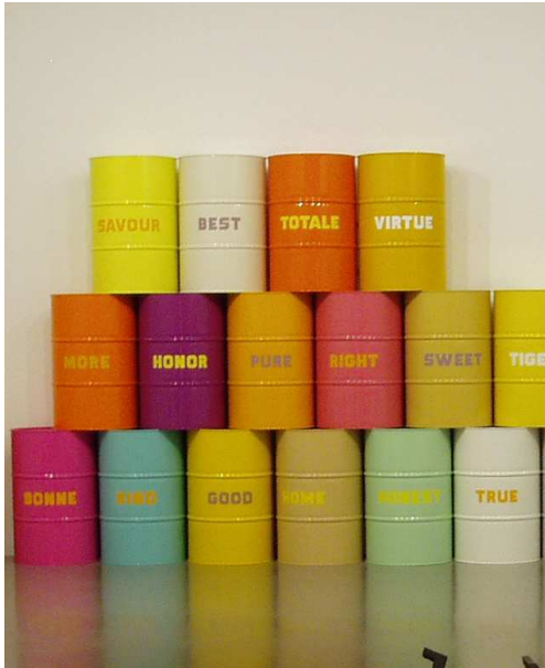
Fig.6: Sweet, Light, Crude (2009, Musée d’Art Moderne de la Ville de Paris)

necessary relationship with the world around (which could be summarized as an ‘importance of the place’), which, in the situation of age-long colonialism and survival, is necessarily political.