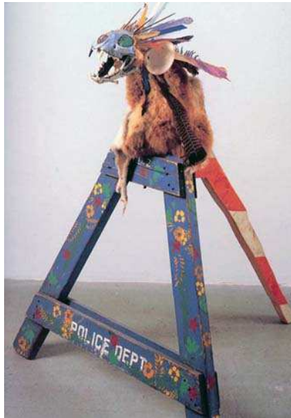
Fig.2: Tlunh Datsi (1985, public collection, Berlin)