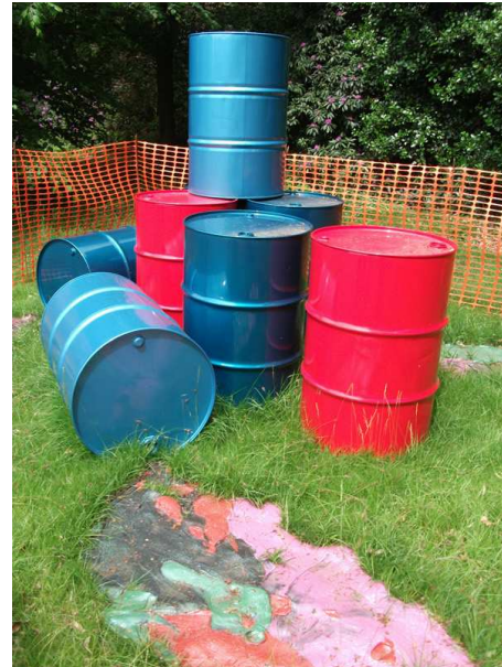
Fig.7: Spring Fever (2010, Tatton Park Biennale, UK)

We could take an extreme example – although his overall approach has to be observed look at the wider range of pieces and practices. Recently Durham has been working increasingly with brightly painted oil barrels. Many commentators have seen these as a departure from his earlier work (because, for example, these are neither obviously ‘craftwork’ nor ‘refuse’). However this world remains basically within the same strand as ever. The artist has said to have used these barrels because of their being ubiquitous, as well as (fig.6) because the words printed on them encouraged him to make poems out of them, and (fig.7) because the barrels relate to oil issues which have wrecked the Cherokee country throughout the twentieth century. Both aspects stand in line with a ‘Cherokee approach’ of objects, and with the (necessarily) activist concern of the Amerindian artist. These works have been exhibited in European international contemporary art spaces, and valued as pieces of Durham’s critical artwork: concerning both general occidental issues and art issues.