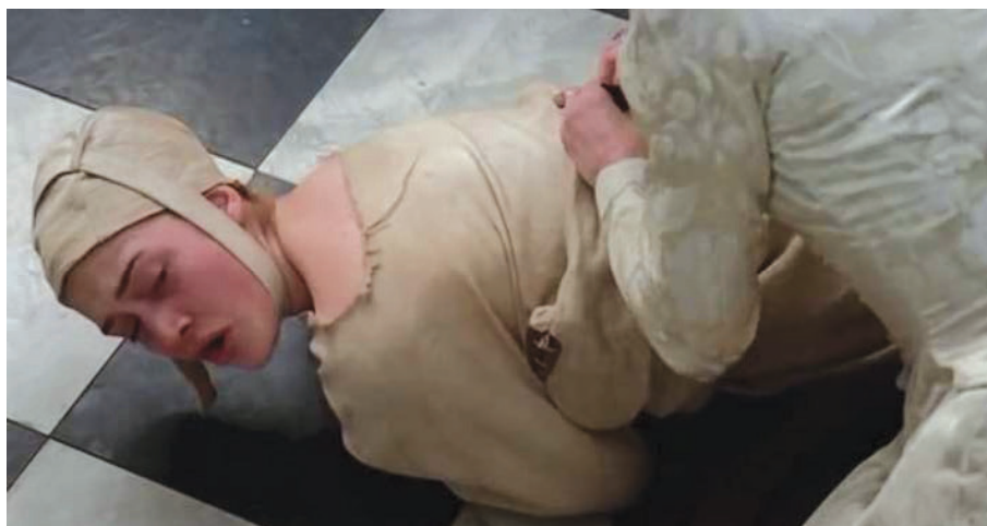
Picture 3 - Frame 1: 18’55”/ CD2. Film Hamlet , dir. Kenneth Branagh.