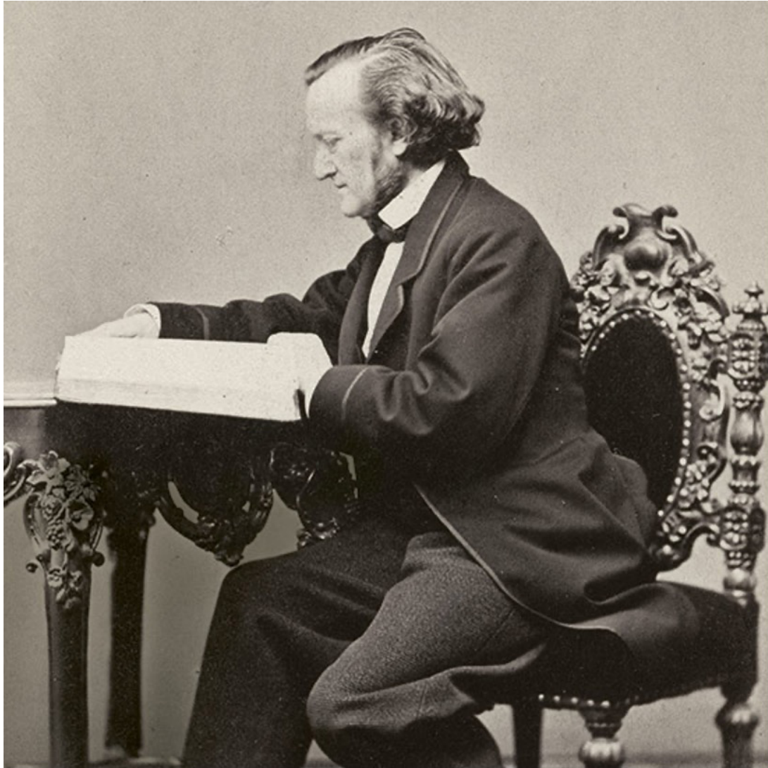
Photo 4. https://www.wagnermuseum.de/en/museum/richard-wagner-stiftung-bayreuth/

Thus, Concentration on Wagner's musical ideas led to such multi-layered dramaturgy, great ideas, a whole gallery of interesting characters in Mann's literary works as well as a great capacity for the worldview of the German writer.