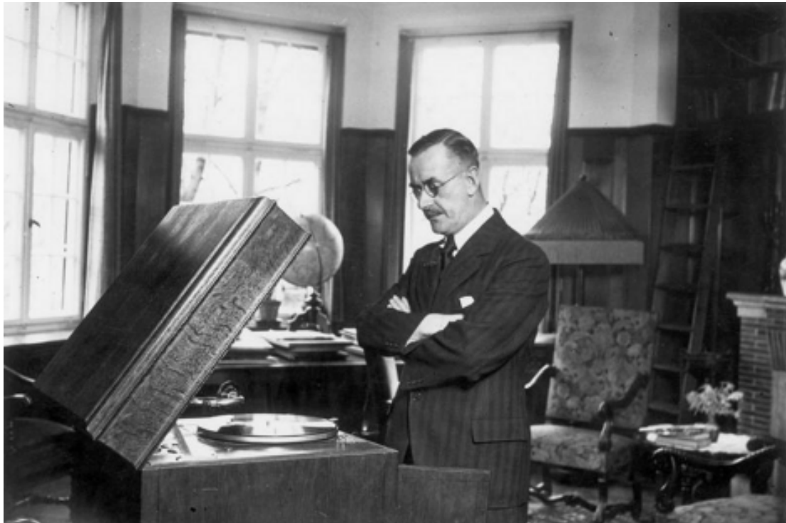
Photo 1. https://medium.com/vatmh/ when-thomas-mann-invented-podcasting-4a885e539f21

During public lessons, Mann developed a method of analyzing the ideas and the symbolism of his novels or novellas with musical terms, emphasizing constantly the charismatic influence of Wagner's music on his writings.