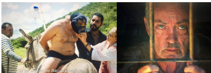
Images 24 and 25: Sending the Mayor into the desert; Entombing the lead shooter