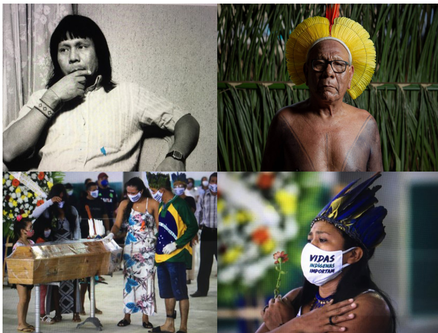
Images 5 and 6: In memoriam: Paulinho Paiakan (Yanomami)(death in 2020 by Sars-CoV-2 – Covid-19)