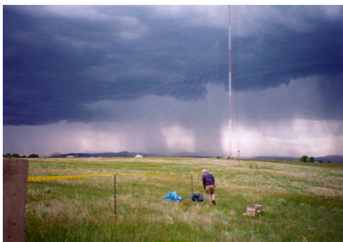
Figure 12: The WWVB station – 60 Khz antenna lowered.

Let us then return to WWVB and its transmissions of atomic time through the atmosphere. What kind of time is this? It is one regulated by 9,192,631,770 energy transitions of the cesium atom. These transitions determine frequency. On WWVB's 60Khz carrier wave, time of day takes one minute to be transmitted through techniques called Pulse Width Modulation and Phase Modulation (Nelson et al., 2005). The time code information is transmitted in a format known as binary coded decimal (BCD) where four binary digits (bits) are required to transmit one decimal number. Bits are modulated by simply lowering and raising the power of the 60 kHz carrier wave. The power is held low for 0.2 s to send a binary zero or for 0.5 s to send a binary one. 2