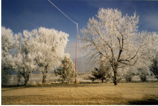
Figure 12: Frost on receiving antenna and trees.

Let us then return to WWVB and its transmissions of atomic time through the atmosphere. What kind of time is this? It is one regulated by 9,192,631,770 energy transitions of the cesium atom. These transitions determine frequency. On WWVB's 60Khz carrier wave, time of day takes one minute to be transmitted through techniques called Pulse Width Modulation and Phase Modulation (Nelson et al., 2005). The time code information is transmitted in a format known as binary coded decimal (BCD) where four binary digits (bits) are required to transmit one decimal number. Bits are modulated by simply lowering and raising the power of the 60 kHz carrier wave. The power is held low for 0.2 s to send a binary zero or for 0.5 s to send a binary one. 2