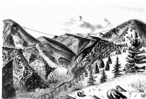
Fig. 4. Artist's conception of the original WWVL antenna in Fourmile Canyon, west of Boulder.

WWVBs signal is not transmitted by a single tower, but relies on a wire mesh suspended over a 400-acre antenna field (Nelson et al., 2005). The soil chemistry beneath the antenna grid is highly alkaline, which makes it a good conductor for electricity. Because the soil conducts so well, WWVB can actually use the Earth as part of the antenna apparatus (Nelson et al., 2005).