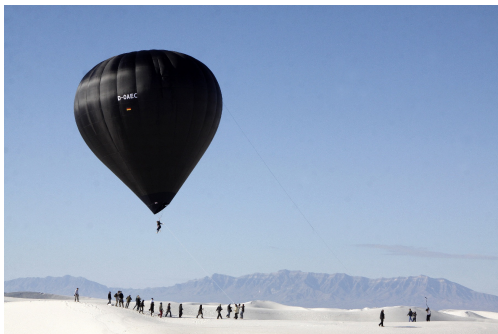
Figure 2: Aerocene, launches at White Sands (NM, United States), 2015

In this text and in my work in general, I am concerned with collective events in sensing space, atmosphere and matter that expose human bodies to phenomena at the edge of perception. I am haunted by examples of suspension and perturbation, such as when an unknown mist rolls darkly onto a summertime beach in Sussex, and equally I am attracted to moments of collective interest and affective flourishing in Earth's atmosphere, such as that occurring in the picture shown here.