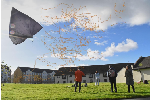
Figure 3: Aerocene Flight, University of Lancaster; Image by Joaquin Ezcurra and Sasha Engelmann.

Now, there is a thread I am trying to trace between the aforementioned atmospheric and cosmic experiences. The highly troubling occasion of an Airborne Toxic Event, or the collective launch of a lighter-than-air, solar powered artwork, are not only aesthetic occasions. They also trace forms of politics in which bodies are extended toward each other and toward the cosmological media that flow between them and among them. They are moments in which a Guattarian ‘rupture’ is felt in spatial, temporal and physical constraints. Atmosphere is a medium and a force for thought, and it is also a realm of transmission through which space and time are made legible and synchronous. At the same time, the atmosphere is a space of transmission through which time might bend uncannily on itself, and as I will related further, through which the measure of time may wobble on its path.