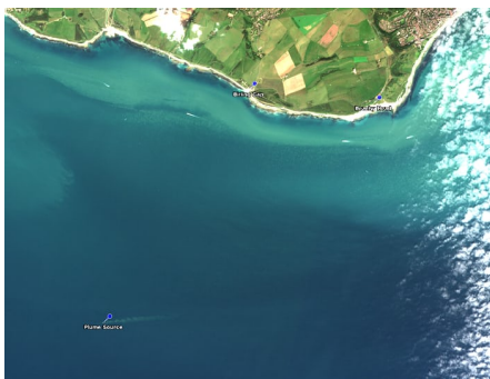
Figure 4: Oceanic plume identified at sunken site of SS MIRA, August 2017

Now, there is a thread I am trying to trace between the aforementioned atmospheric and cosmic experiences. The highly troubling occasion of an Airborne Toxic Event, or the collective launch of a lighter-than-air, solar powered artwork, are not only aesthetic occasions. They also trace forms of politics in which bodies are extended toward each other and toward the cosmological media that flow between them and among them. They are moments in which a Guattarian ‘rupture’ is felt in spatial, temporal and physical constraints. Atmosphere is a medium and a force for thought, and it is also a realm of transmission through which space and time are made legible and synchronous. At the same time, the atmosphere is a space of transmission through which time might bend uncannily on itself, and as I will related further, through which the measure of time may wobble on its path.