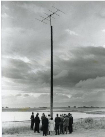
Figure 9: WWVB/ WWVL station dedication, 1963.

was hypothesized to change during the solar eclipse that would pass over North America on August 21 st 2017.