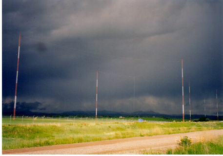
Figure 10: The WWVB station

60 KHz is in the low frequency band, with a wavelength of 5000 meters. Large wavelengths require large broadcast antennas.