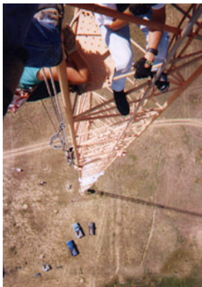
Figure 14: View from the top of one of WWVB's towers.

However what happened is likely much more complex. For several months, and together with my frequent collaborator Sophie Dyer, I have been in touch with radio amateur Bill Liles, NQ6Z, and one of the inventors of the EclipseMob experiment. Bill told us that the effect of the eclipse on the time signal could be more like a wobble. This is a phenomenon documented first by famed radio scientist William Eccles in 1912 (Nelson, 2017). It was again observed on transmissions from the Eiffel Tower. During the solar eclipse that passed over Europe in 1999, five amateur radio operators, each at a different location, observed a signal from a 75 KHz transmitter making various types of “W’s” on their spectrum graphs (Liles, personal communication). Why this happens is not fully understood. The transitions of a Cesium atom might stay constant in the midst of an eclipse, but human, technological and planetary bodies are affected and repositioned. The wobble in the very-low-frequency signal is the trace.