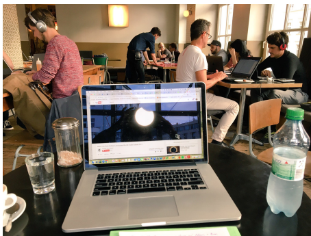
Figure 6: Viewing the eclipse at St. Oberholz café, Berlin.

Only a few days before the toxic mist drifted onto Birling Gab beach in Sussex, a solar eclipse occurred over North America. Thousands of people flocked to the path of totality , purchasing special sunglasses to enable viewing of the cosmic event. Man can be in ecstatic contact with the cosmos only communally , Walter Benjamin wrote in 1923. Like a solar eclipse, these words have a dark ring to them, since at the time of his writing, Benjamin was referring to the communal event of planetary war in which, “gases [and] electrical forces were hurled into the open country, high-frequency currents coursed through the landscape, [and] new constellations rose ...” (Benjamin, 1923). These are conditions that describe the present even more than they described the time of Benjamin’s writing. And they are conditions that are as cosmic as they are atmospheric and political.