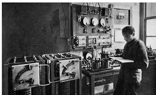
Figure 8: Alphonse Berget; Eiffel Tower Radio Station, 1914

Perhaps most unusual among these group of listeners were those who tuned in to the ways in which the eclipse altered the transmission of time. They were able to do so because time is transmitted through the atmosphere, and the atmosphere was affected by the solar eclipse. I find this case compelling because, notwithstanding the constellations of orbiting satellites that also synchronize global time, it suggests that the measure and reception of time are not necessarily as constant as most of us might think. Time can be altered by the qualities of Earth's atmosphere, and by the various cosmic forces that influence it. And inscribed in the fact that time is transmitted through the air, are histories and legacies of human experiments in atmospheric and cosmological space. For the remainder of this text I would like to focus on this point.