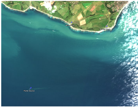
Figure 1: Oceanic plume identified at sunken site of SS MIRA, August 2017

In Don DeLillo's 1985 novel White Noise , an accident involving a tank car releases, "a feathery plume" and then "a black billowing cloud" that finally becomes "an Airborne Toxic Event". On August 28 th 2017, a mist drifted toward the Sussex coastline at Birling Gap Beach, causing acute respiratory illnesses in over 150 people before dissipating without being identified. A symptom of the Airborne Toxic Event in DeLillo's novel is an acute sense of déjà vu . The Sussex toxic mist was later traced to an oceanic plume emerging at the same spot that the SS Mira , a 3,700-tonne armed tanker, was sunk by a mine from a German submarine on October 11 th 1917, almost exactly 100 years ago. 1 Atmospheric histories haunt an atmospheric present. Time folds uncannily on itself as we remember, and forget again, the heavy weather that once disturbed a night's sleep or an aerial journey; the repeated and prolonged violence of tropical storms in the Caribbean; the El Niño season that returned far too soon. Intrinsic to this forgetting, and to