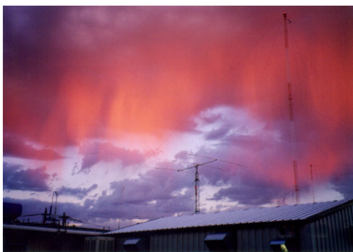
Figure 7: The WWVB station during sunrise

There were many who listened to eclipse. There were those who tuned in to the eclipse on the radio spectrum. Like so many voices hurled into the air, thousands of radio amateurs across the nation "lit up the ionosphere" with a nationwide "QSO" (radio contact) party. It was necessary to have a party because the more radio amateurs were transmitting during the eclipse, the greater the amount of information that could be gathered on how an eclipse alters the conditions of amateur radio bands. In addition, amateur astronomers recorded the musical phenomena caused by interactions between Earth's magnetosphere and the Sun. Still others recorded specific AM radio transmissions in order to catch unusual glitches, wobbles and distortions caused by the brief, cosmically enhanced nightfall.