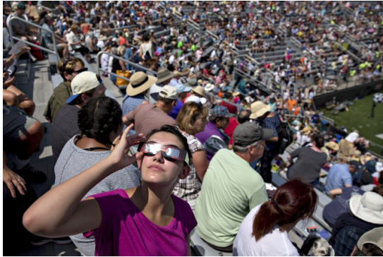
Figure 5: Solar eclipse viewing; Source: Daniel Acker / Bloomberg / Getty

Let us return to a moment last summer, and more precisely let us return to the month of August 2017.