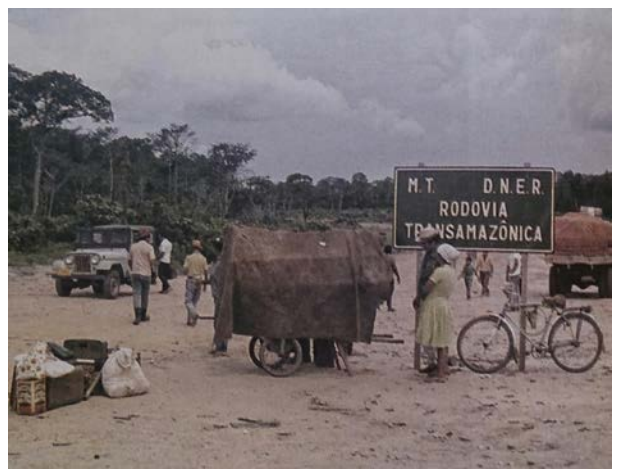
Photo 1 - Opening of the Trans-Amazonian, 1971. Source: www.exposicoesvirtuais.arquivonacional.gov.br Figure 1 - Northeastern arrival by the newly open road. Author: Oswaldo Maricato/Editora Abril. Source: VESENTINI; VLACH. Geografia Crítica, 2009.

Its construction dates back to the year 1971 and brought whole families that came from the northeast already in this period and over the years 1970 and 1980 to occupy the land and make history conceived as nonexistent. The Trans-Amazonian Project was not restricted to the region, neither to geography, as pointed out by Souza (2010 p. 7) when wrote that