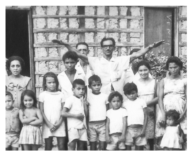
Photo 3 - Mestre Gabriel (with open arms) in Porto Velho, the 60s.