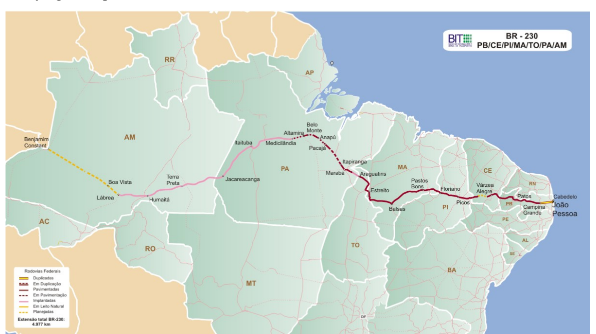
Map 1 - Trans-Amazonian Highway (BR-230), without scale. Source: Information Base and Transport Maps of Ministério dos Transportes, 2014.

It is a story of terror and destruction. The new space was produced on previous space conditions, established relationships and that are broken down not only by the violence of State, but by a conception that unites faith and reason, sacrifice and opportunity, emulating certain messianism of northeastern base, but not exclusive to it which turns out to be potentiated by State inculcation of a "land without men", virgin to be dominated, in which the hero has something tragic and terrifying (Campbell, 2013).