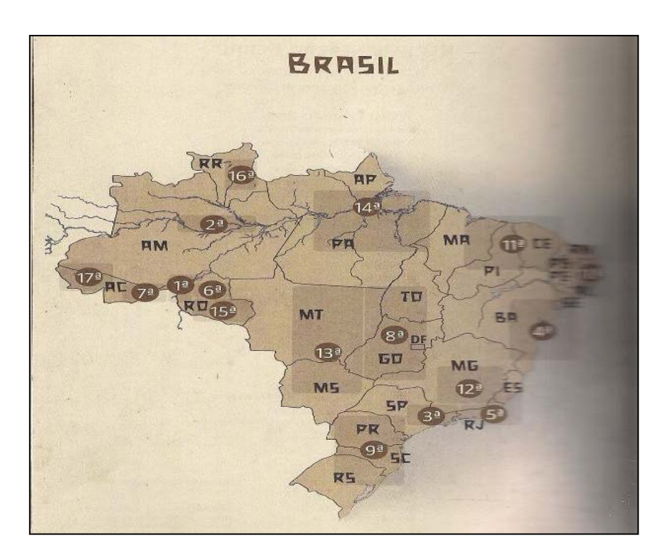
Figure 3 - Map of Brazil per Regions of UDV.

The expansion of this religious society takes from the territory meant as sacred, using material techniques to effect expansion and maintenance, present in all regions of Brazil, including abroad.