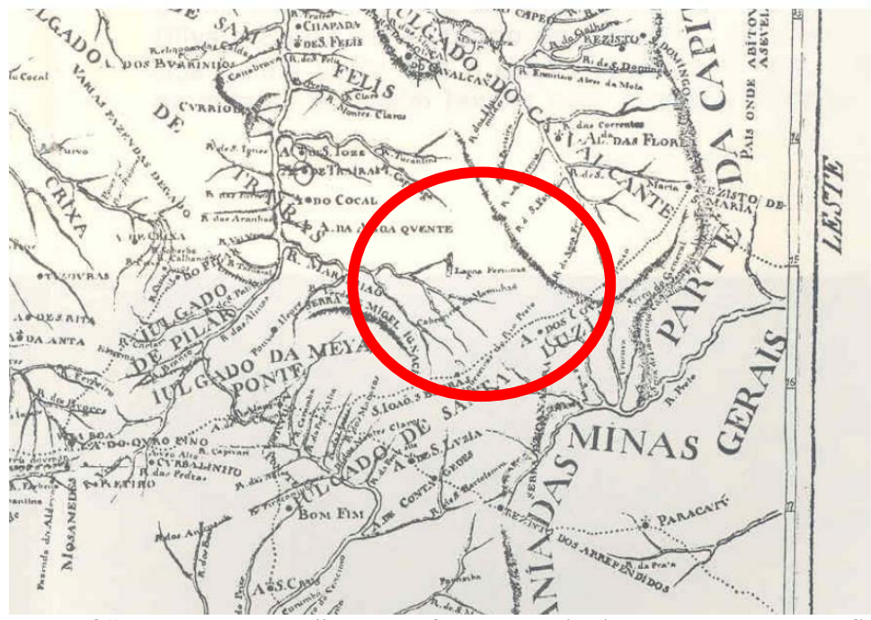
Figure 4 - Fragment of "Mapa dos Julgados" - a part of the map which includes the Julgado de Santa Luzia and the Julgado de Três Barras, bounding historical locations in the Distrito Federal. Circled in red is the approximate area where the capital would be built. Source: Vieira, Jr., 2009, p. 8.

The space that today conforms what we know as Brasilia has a history dating back to the colonial Brazil, however, the discourse that seems to prevail in the official ideology is that of a non-existent geographic area before the construction of the New Capital Federal, or no more than one spatiality in latency, waiting to be appropriated.